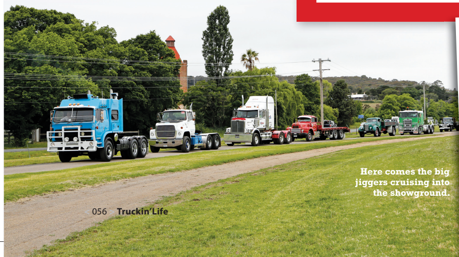
Here comes the big jiggers cruising into the showground.