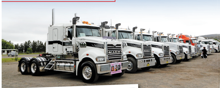
Some of the great trucks that took part in the convoy to raise money for charity.