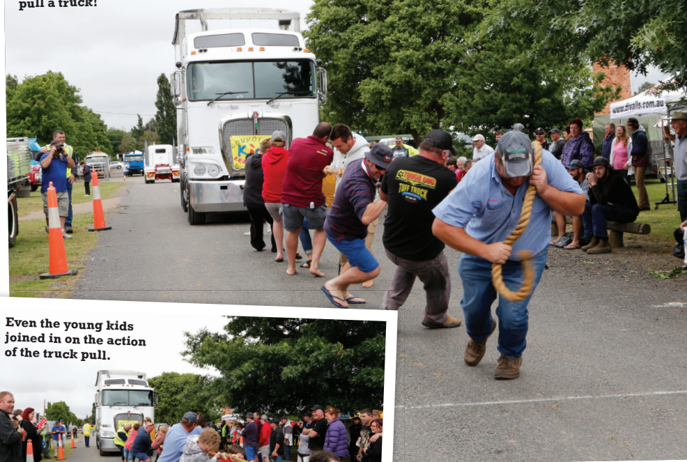
Even the young kids joined in on the action of the truck pull.

Who needs horsepower when you can have human power pull a truck!