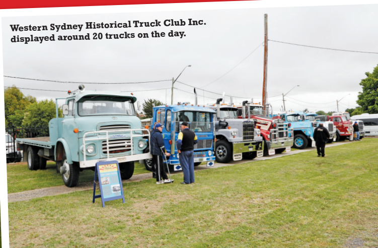
Western Sydney Historical Truck Club Inc. displayed around 20 trucks on the day.