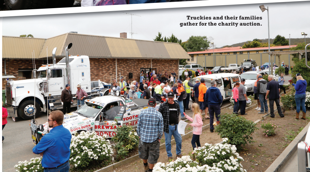
Truckies and their families gather for the charity auction.