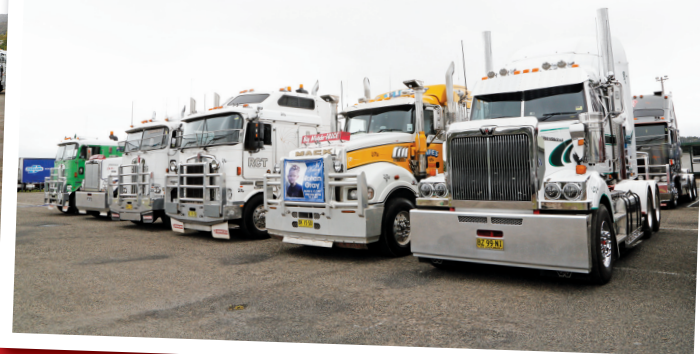
No matter the truck make, the Goulburn convoy sure did not disappoint.