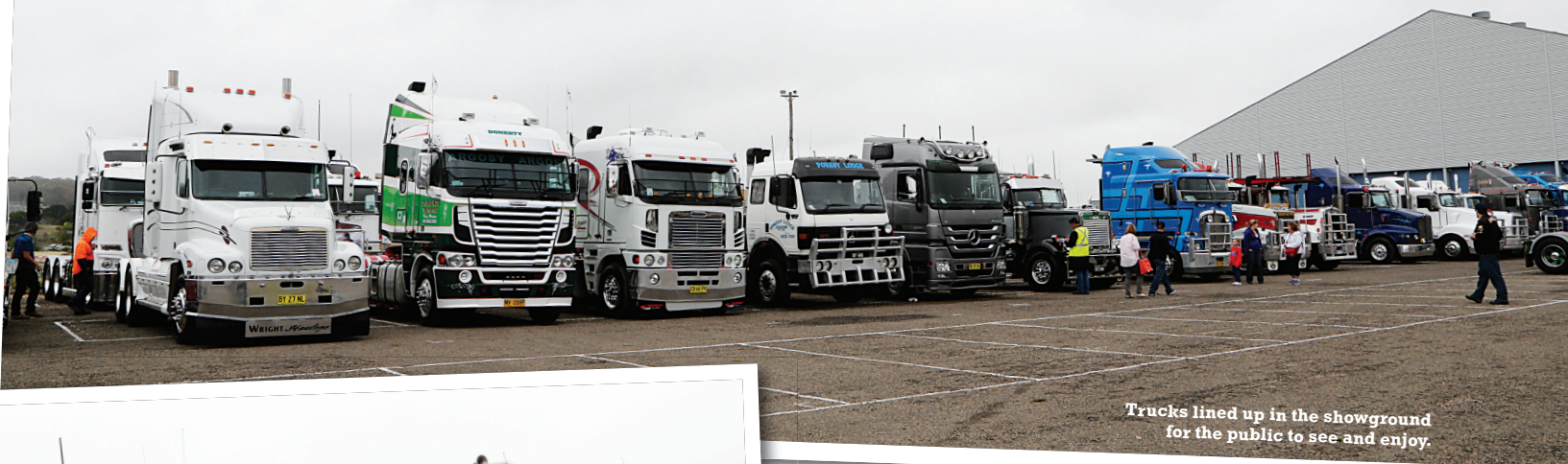
Trucks lined up in the showground for the public to see and enjoy.