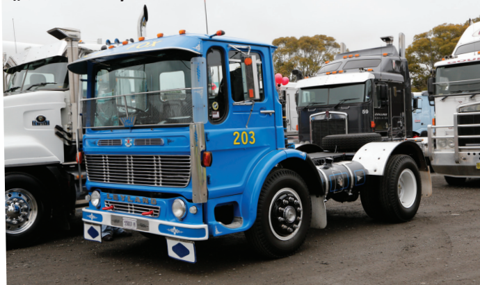
Immaculately restored Leyland single drive prime mover fitted with an externally mounted fuel gauge on the fuel tank.

OVER 120 PLUS TRUCKS TOOK PART IN THE CONVOY